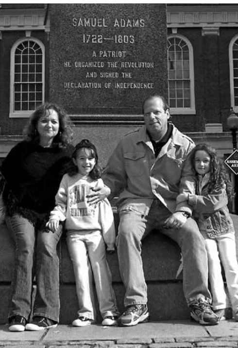
Our family before ALS impacted our lives.

PS Your gift makes this program possible. Please give today at www.alsphiladelphia.org/abrams . And if you can, please consider making your gift a monthly one.